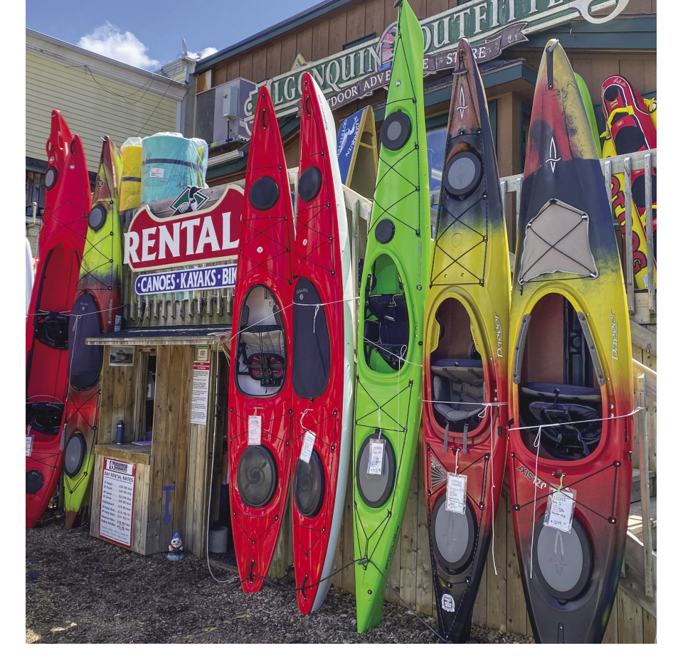
Algonquin Outfitters offers everything from canoe rentals and camping gear to technical clothing

Contests like the annual Ice Out contest asks entrants to guess the ice out date for Lake Opeongo to win a gift card, while the monthly photo contest and gift card draw give plenty of ongoing opportunities to win. As we all prepare for a much-needed summer season ahead, our collective thirst for the great outdoors and connection to nature, exploration, and nearby adventure is more prevalent than ever before. Algonquin Outfitters offers all this as a pillar for community that inspires, engages and supports locals in their quest for well-being and leisure across all four seasons.