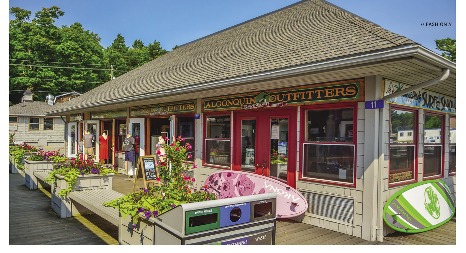
Algonquin Outfitters' Port Carling location is a relatively new addition to the Algonquin Outfitters family. Located at 119 Medora Street Steamboat Bay Port Carling, Ontario.