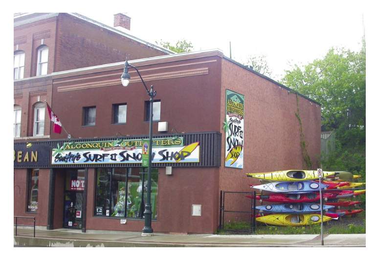
AO Swifty's Surf and Snow is a new addition to the Algonquin Outfitters family. Located at 60 Manitoba Street Bracebridge, Ontario.

Outfitters as it still exists today. During the winter, find Algonquin Outfitters at ski hills Hidden Valley and Sir Sam's; in the summer, a whitewater school on the Gull River between Haliburton and Minden is open to anyone who wants to try paddling white water kayaks with the guidance of an instructor.