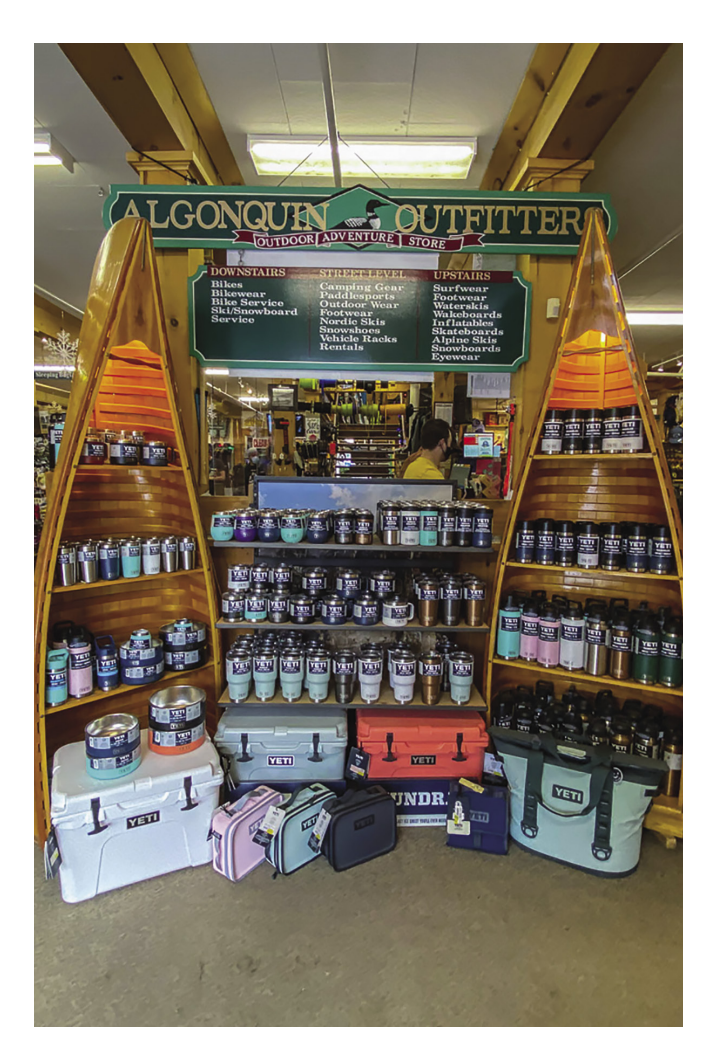
Algonquin Outfitters carries everything from hiking, canoeing, and kayaking gear, to the necessities of lounging fireside.