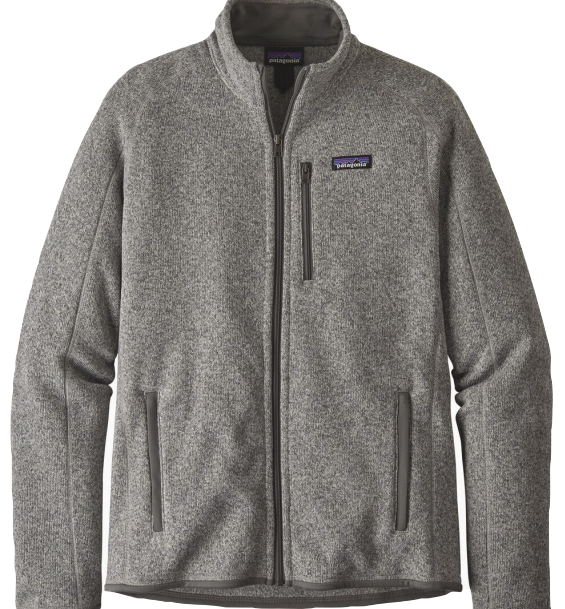
Patagonia Better Sweater Fleece Jacket $159.98