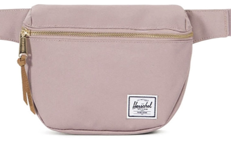
Herschel Fifteen Hip Pack $39.98