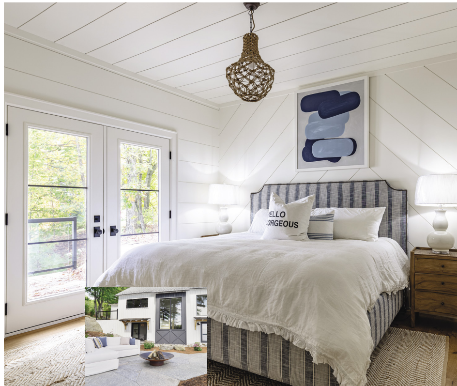
The main floor master bedroom boasts double doors to a private deck overlooking the lake.

With custom cabinetry designed by Red Bean, hardware by Emtek and Top Knobs, and lighting by Hudson Valley, the fixtures and appliances have a recognizable stamp of Red Bean’s style in every room, and the design house supplied all the furnishings as the perfect complement to its pleasing, modern aesthetic. The shiplap throughout the entire cottage was supplied by Muskoka Lumber, giving that rustic yet crisp appearance to the space.