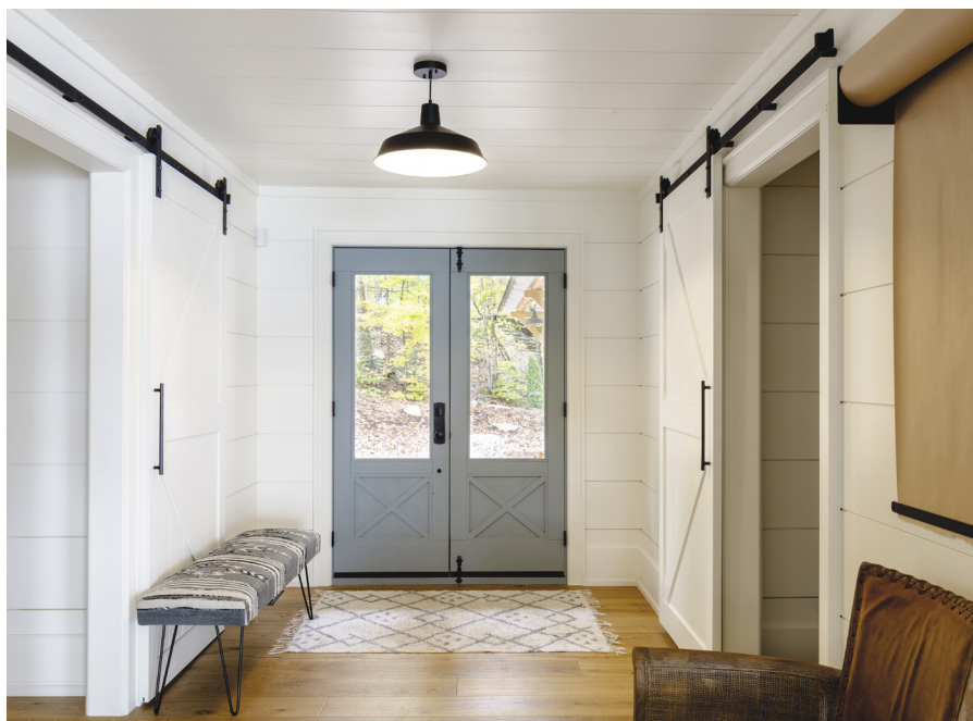
McLennan worked with Otley Design to create custom front doors and sliding barn doors in the entryway.

The most surprising part of this project was in the unfolding of the finished cottage and its invitation to welcome the beauty of Muskoka into the very essence of the space's infrastructure. ➤