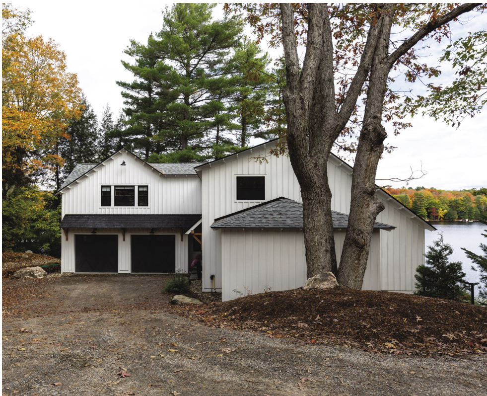
A large loft with bathroom was added above the two-car garage.