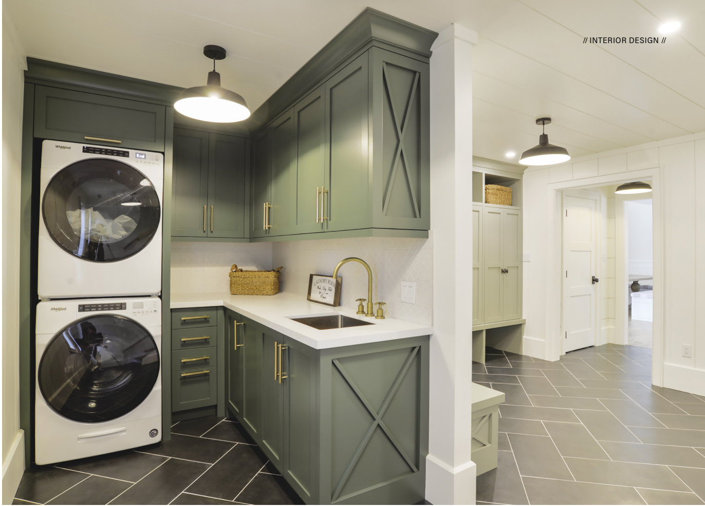
The laundry room and mudroom keep everything tucked away in a wall of cabinets and can accommodate plenty of visitors.