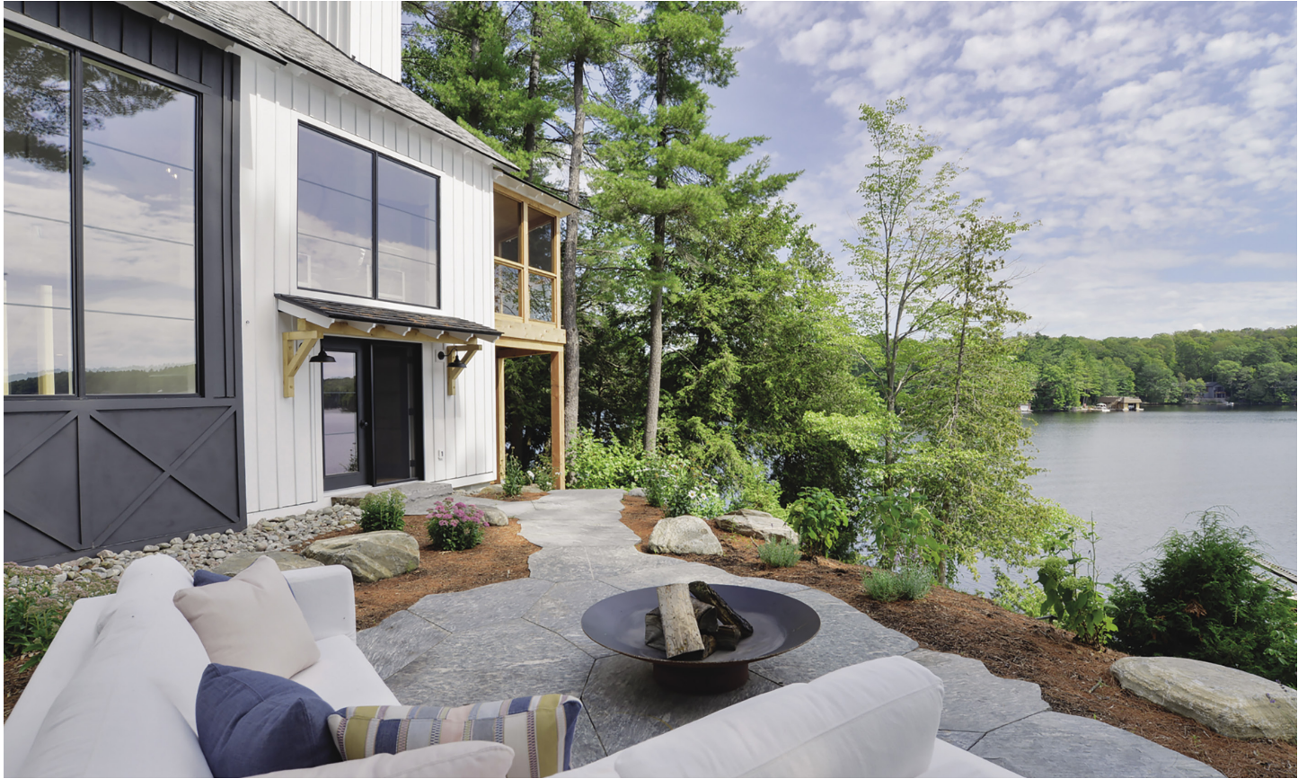
The outdoor firepit overlooks breathtaking views of Lake Muskoka.