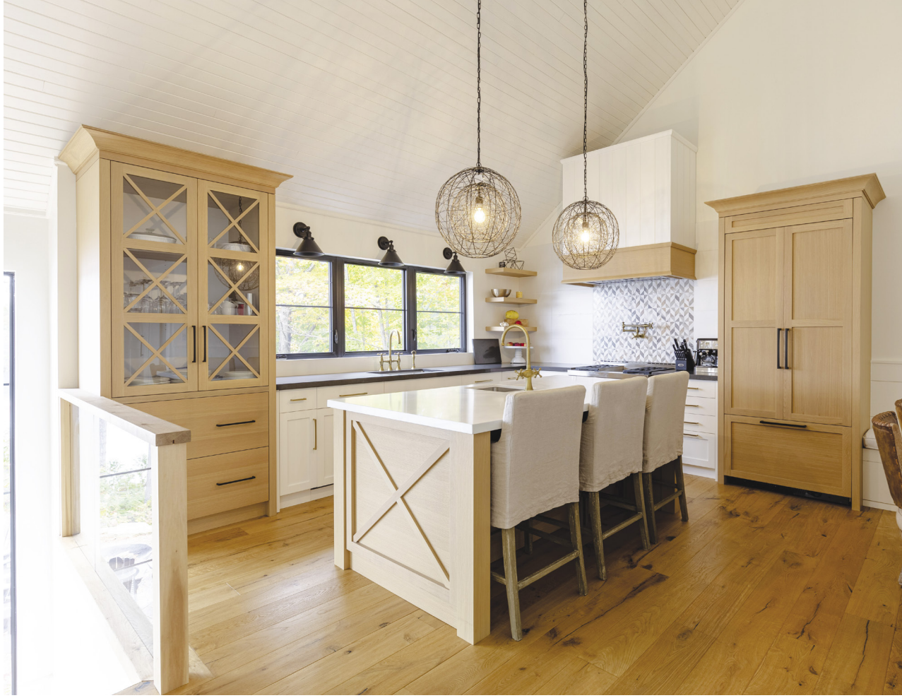
The kitchen island provides additional seating while waterfront views can be enjoyed by the chef and diners alike.

It was particularly breathtaking for McLennan to discover “just how incredible the views are of the lake from the comfort of the living room.” Bright spaces that become a part of the day’s natural rhythms from sunrise to sunset make living in a Scandi-modern space all the more appealing, and in particular when nestled amid the sights and sounds of mother nature.