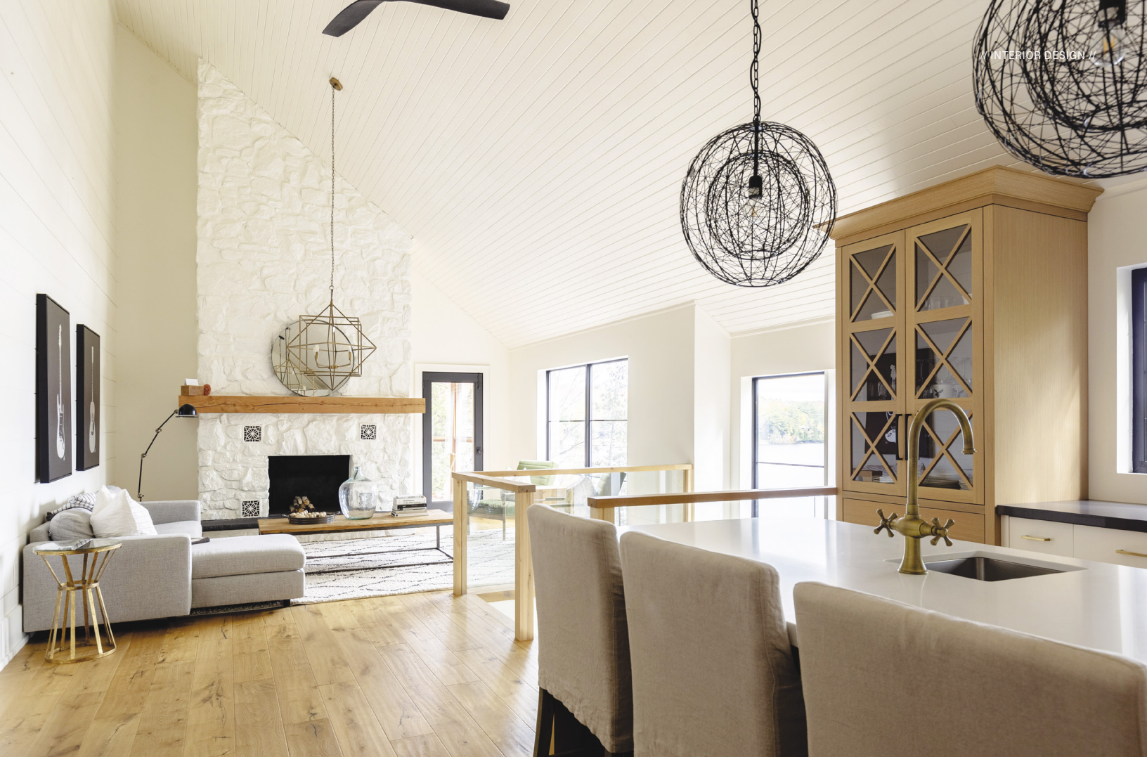
The granite fireplace was painted white to modernize the open-concept living room and adjacent kitchen.

"We are a family of five and creating lots of space for our growing family was important," says McLennan. "Renovations always pose challenges and inspire great creative thinking to tackle limitations," she says, "from existing structures as well as implementing additions."