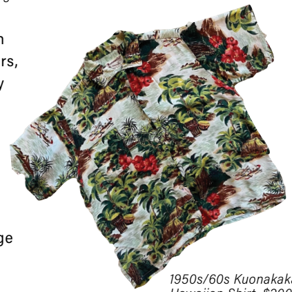
1950s/60s Kuonakakai Hawaiian Shirt, $200