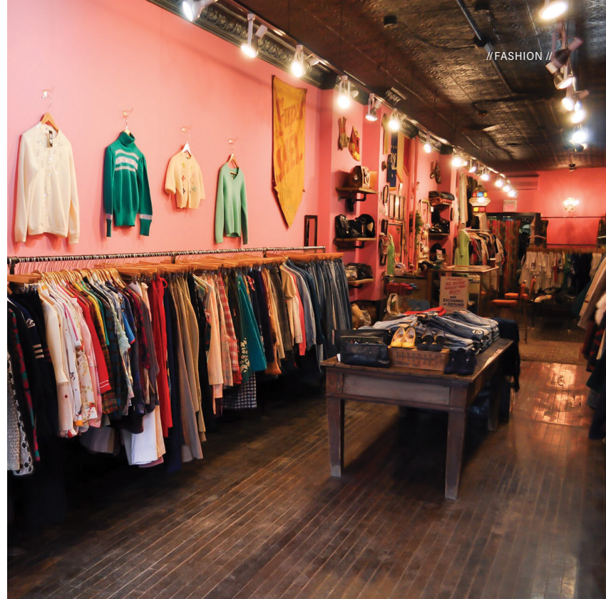
The store carries a range of special pieces from the early 1900s to the 1990s. Every item at Mama Loves You is chosen with love, shipped across the country, washed, mended and steamed before becoming available to customers.