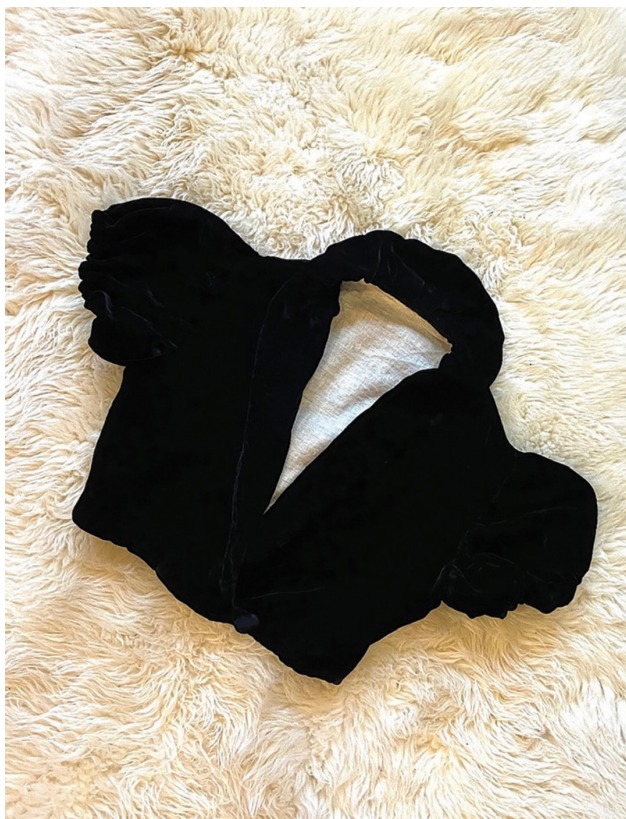
1930s Black Silk Velvet Jacket, $125