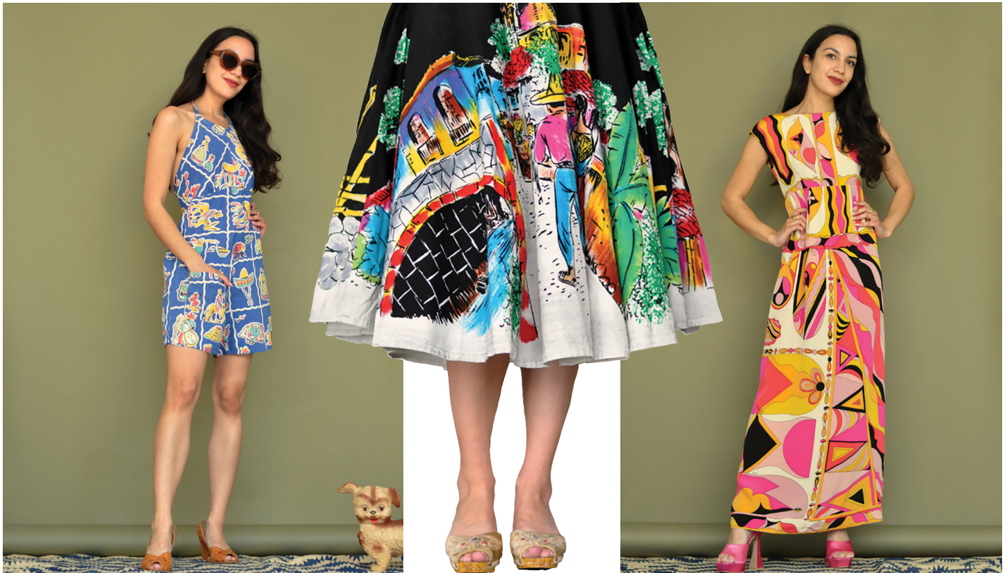
1940s Mexican Print Halter Playsuit, $25

Mama Loves You Vintage is a mother-daughter-owned vintage boutique with a curated selection of pre-loved fashion from the 1900s to 1990s